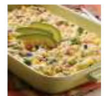
Annual Parish Meeting January 29th