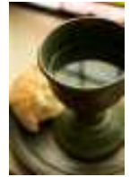
Midday Eucharist every Tuesday in December