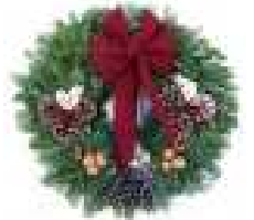
Decoration of Church December 22nd