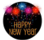
Annual New Year's Eve Labyrinth Walk