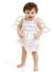
No-rehearsal Christmas Pageant December 24th